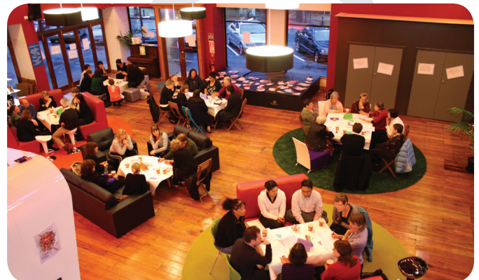
Child health/tamariki ora forum, October 3 rd 2011.

From this activity a work plan is currently being drafted. Emphasis has been placed on the better sharing of information as well as improved collaboration between primary and secondary care. When endorsed by the TSG a copy of the work plan will be placed on the MDHB website so watch this space!